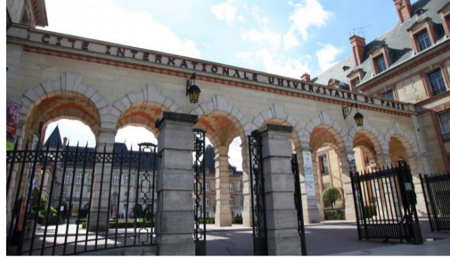
The entrance to Cité Internationale Universitaire de Paris

Private metro station CIUP has its own metro sta-