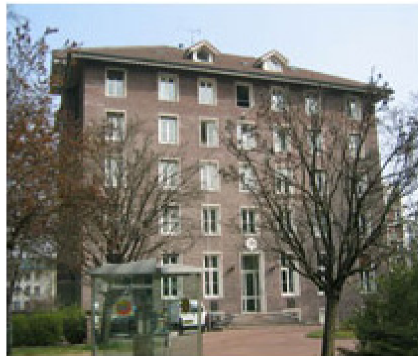
The Danish dormitory in CIUP, Paris.

Fact box Cité Internationale Universitaire de Paris is located in the southern part of Paris and consists of 40 dormitory buildings each donated by a country.