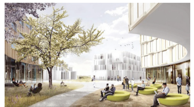
The master plan contains proposals on student city's inception and expansion plans for ongoing expansion