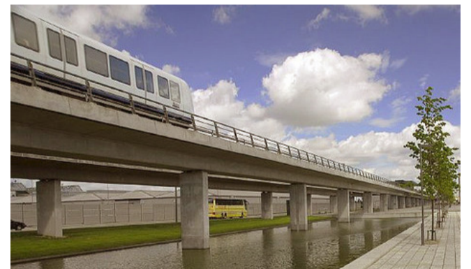
The location close to a metro station is an important part of the project