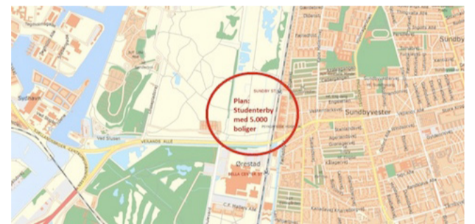
The Danish student city proposed to be located in an area between Sundby metro station and Amager Fælled