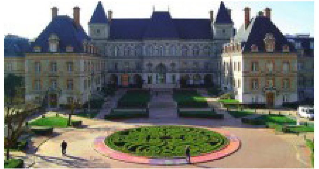
The very impressive international house in CIUP in Paris is built in the same style as the Fontainebleau Castle

Henning Larsen's studio (the company behind among other projects Copenhagen Opera House), has prepared