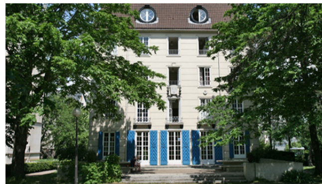
The Swedish student building in CIUP in Paris.

a master plan for the project based on a location in Copenhagen. The master plan can be downloaded from www.iscc.nu .