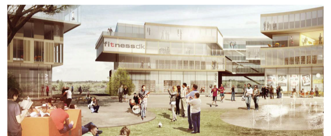
Henning Larsen's studio has already prepared a master plan for the student city